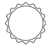
A - A DETAIL